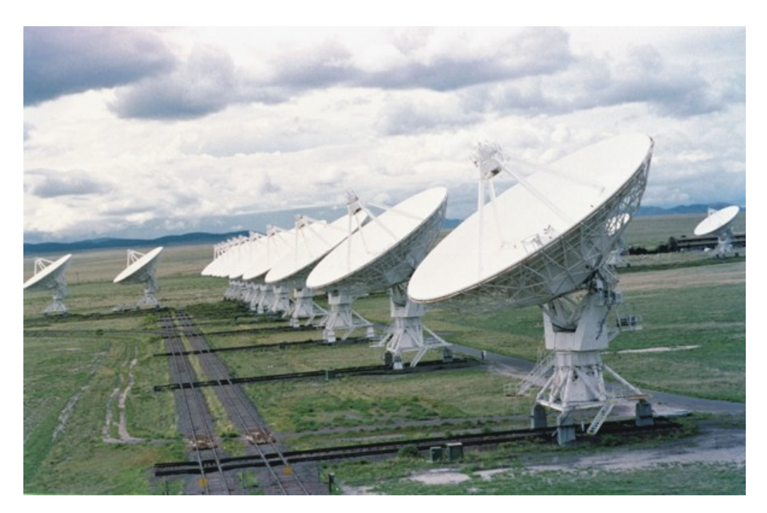
Figure 4: Typical radio astronomy site located in Socorro, NM

The 608 – 614 MHz band is shared by radio astronomy in several remote areas of the country. Radio astronomy sites such as the one shown in Figure 4 are used to map the radio energy coming from the distant reaches of the universe. Consequently, these sites are highly sensitive to energy that could come from a nearby transmitter such as those used for WMTS. Thus, the FCC requires that ASHE coordinate WMTS usage with radio astronomy for deployments that fall within these areas. Figure 5 shows the locations of the thirteen radio astronomy sites in the US, as well as a protected area around each site. A detailed list of the radio astronomy sites can be found at the end of this user guide.