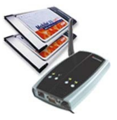
Figure 2: Wireless LAN Components